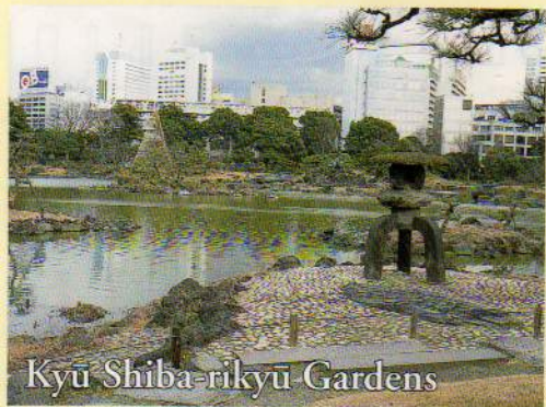
Kyū Shiba-rikyū Gardens