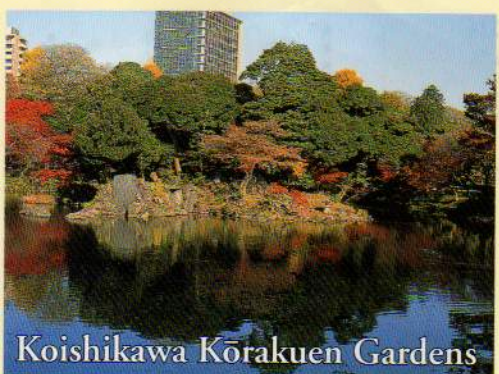
Koishikawa Kōrakuen Gardens