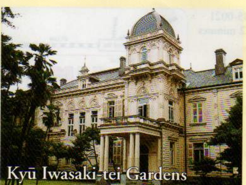
Kyū Iwasaki-tei Gardens