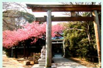
Taiwan cherry of Ebarajinja Shrine

*The estimated time is based on the route indicated by the dotted line on the map.